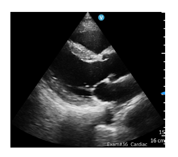
Parasternal long axis view (PLAX)