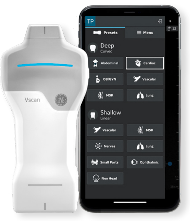
Vscan Air SL (sector/linear) See More. Treat Faster.