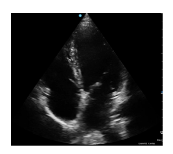
Apical 4 chamber view